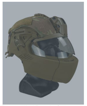
Integrated Head Protection System (IHPS) with Face Shield