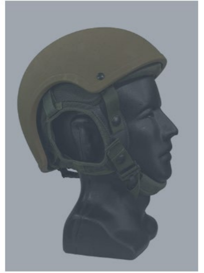
Advanced Combat Vehicle Crewman Helmet (ACVC-H)