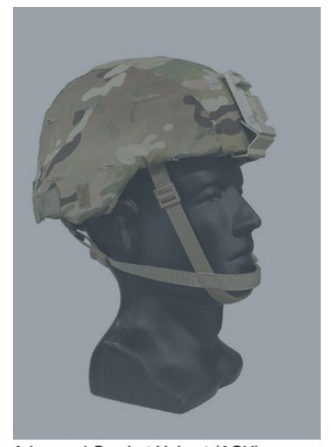
Advanced Combat Helmet (ACH)