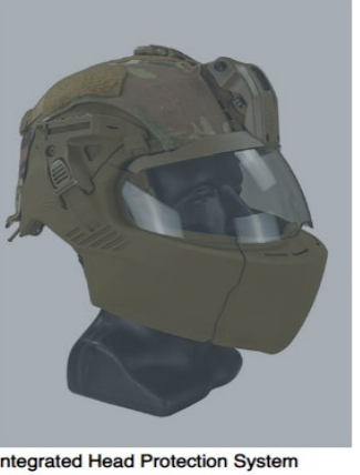
Integrated Head Protection System (IHPS) with Face Shield