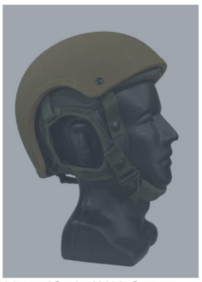
Advanced Combat Vehicle Crewman Helmet (ACVC-H)